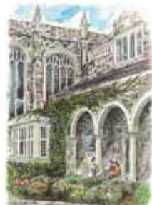
CC-26. Law Quad: Cloisters