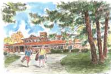
S-8. Golf Clubhouse