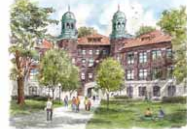
CC-15. Engineering Arch #3