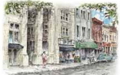
AT-6. State St #2