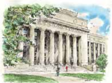
CC-1. Angell Hall #1