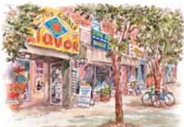
AT-13. South State St near Packard