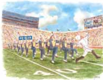
S-2. Marching Band