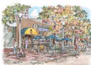
AT-14. South U./Brown Jug