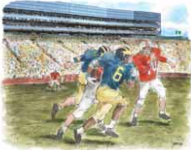
S-1. Football Game

SCENES of Sports, North Campus, & the Arb