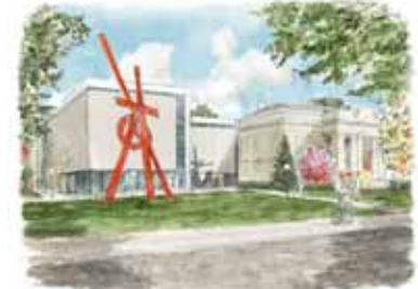
CC-6. Art Museum