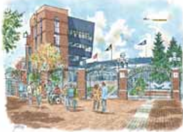
S-4. Stadium Gates #2