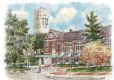
CC-33. Mich League & Burton Tower