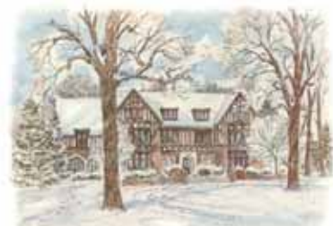
AT-15. Fraternity/Sorority Row