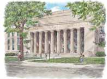
CC-3. Angell Hall #3