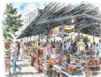
AT-11. Farmers Market