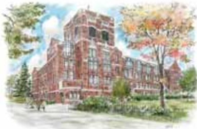
CC-31. Lorch Hall