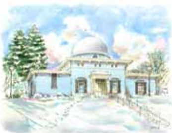
CC-40. Observatory, Detroit