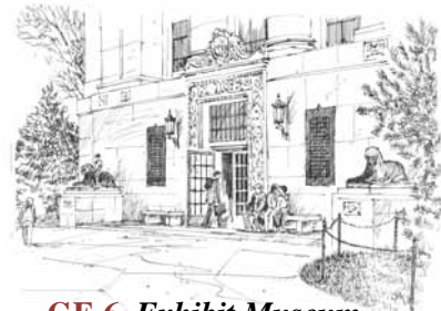
GF-6. Exhibit Museum (Museum of Natural History)