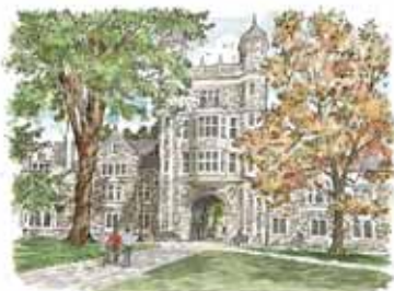
CC-25. Law Quad Arch #2