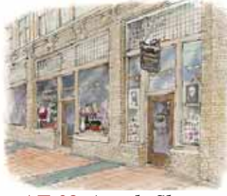
AT-23. Arcade Shops