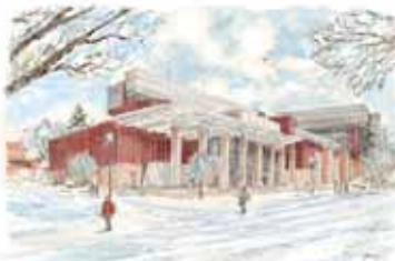
W-11. Ross School of Business (winter)