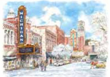
W-6. Liberty Street (winter)