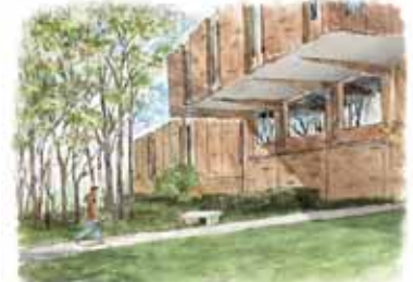
NC-3. School of Music Bldg