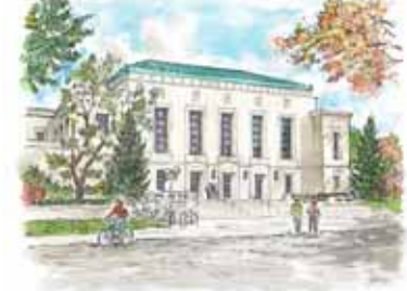
CC-42. Rackham Hall