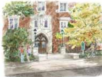
CC-32. Martha Cook Bldg