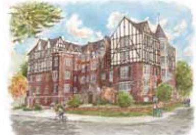
CC-21. Kinesiology, School of