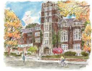
CC-36. Michigan Union #1