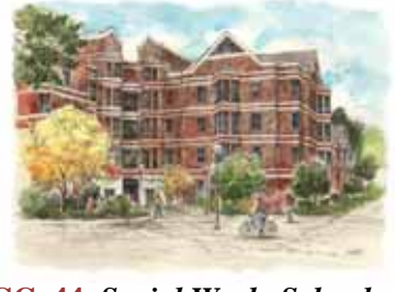
CC-44. Social Work, School of