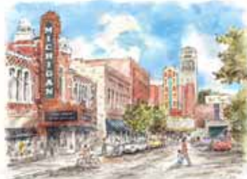
AT-8. Liberty Street