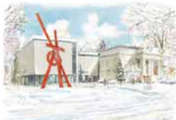
W-2. Art Museum (winter)