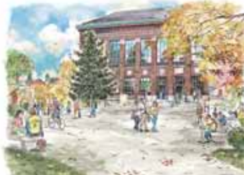
CC-11. Grad Library/Diag