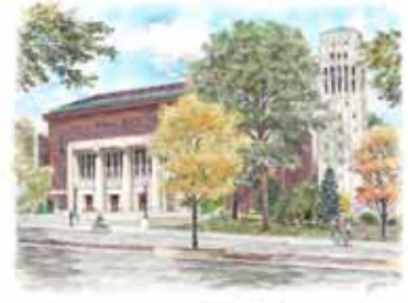
CC-18. Hill & Burton Tower