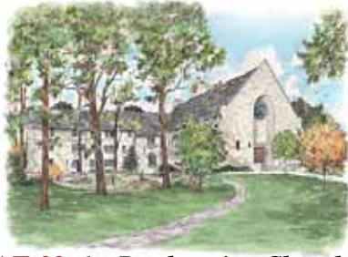
AT-22. 1st Presbyterian Church