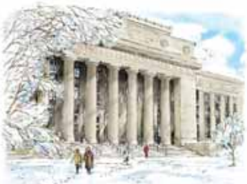
W-1. Angell Hall (winter)