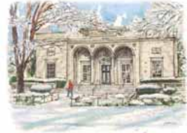
CC-9. Clements Library