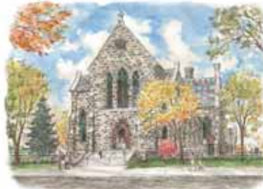
AT-20. 1st Congregational Church