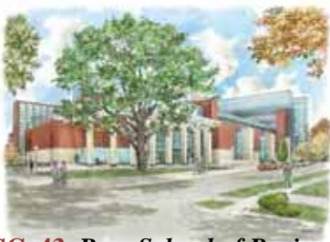
CC-43. Ross School of Business