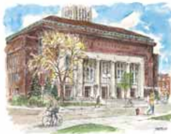
CC-17. Hill Auditorium #2