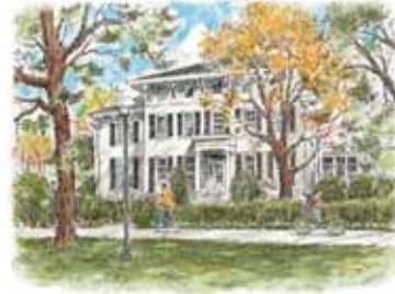
CC-41. President's House