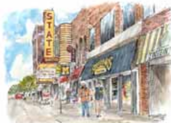
AT-7. State St with M-Den