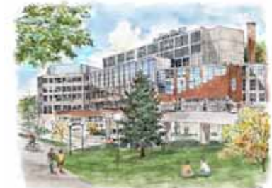
CC-30. Life Sciences