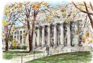
CC-5. Angell Hall #5