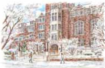
W-9. Michigan Union #2 (winter)