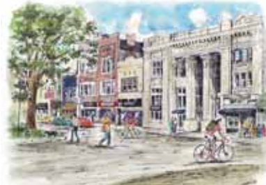
AT-4. North U. & State St. #2