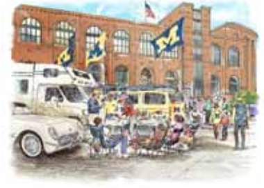
S-6. Trunk Lunch #1