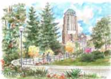
NC-1. Lurie Tower #1