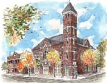
AT-19. Old Firehouse/Hands-On Museum