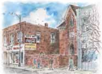
AT-10. Williams near State St