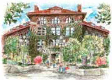
CC-13. Engineering Arch #1