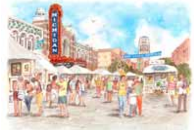
AT-9. Art Fair