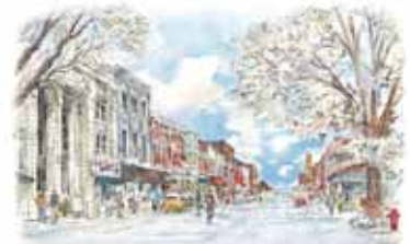
W-12. State Street (winter)