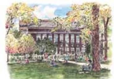
CC-12. Graduate Library