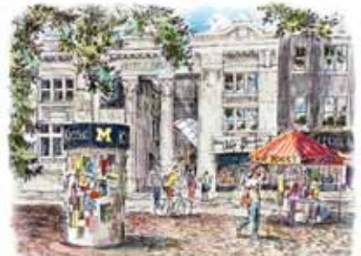
AT-3. North U. & State St. #1