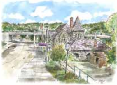
AT-16. Broadway Bridge/Old Train Depot