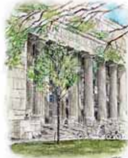
CC-2. Angell Hall #2