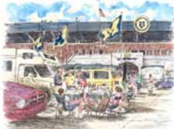
S-7. Trunk Lunch #2