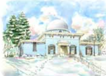
W-14. Observatory (winter)

...and many, many more of the "favorite" scenes are available in a winter setting. Please inquire!