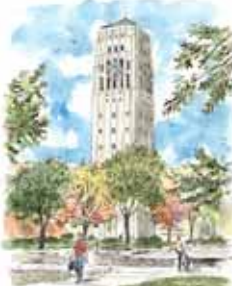
CC-7. Burton Tower