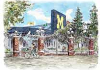
S-3. Stadium Gates #1