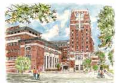
CC-39. North Quad