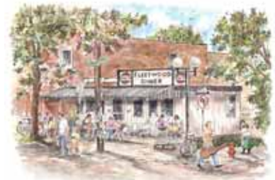
AT-12. Fleetwood Diner