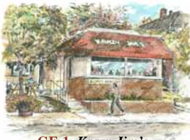
GF-1. Krazy Jim's