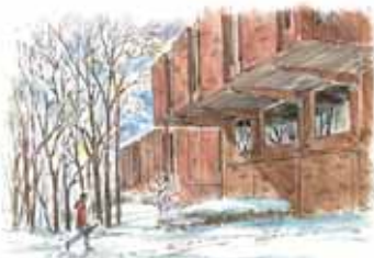
W-10. Music School (winter)