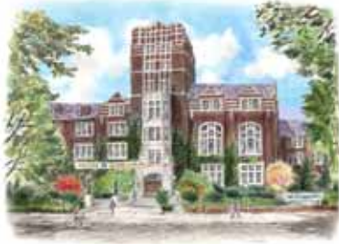
CC-37. Michigan Union #2