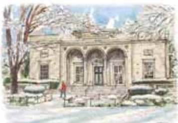
W-13. Clements Library (winter)