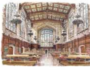
CC-23. Law Library Reading Room