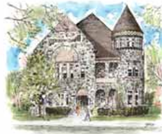
CC-20. Kelsey Museum