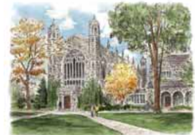
CC-27. Law Quad: Lawyers Club