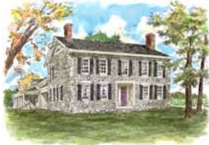
AT-17. Cobblestone Farm