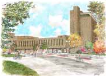
CC-10. Dentistry, School of