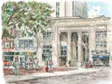
AT-1. Nickel's Arcade #1