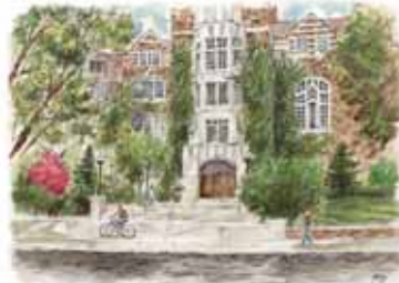
CC-38. Michigan Union #3