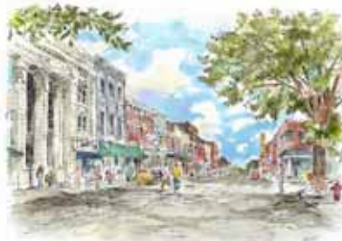
AT-5. State Street #1