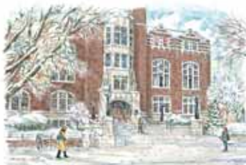
W-8. Michigan Union #1 (winter)