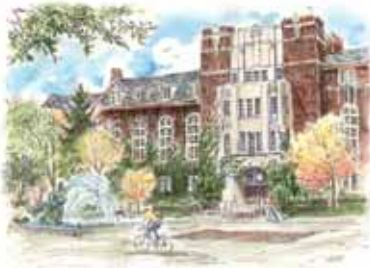
CC-34. Michigan League