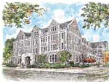
CC-29. Law School: South Hall