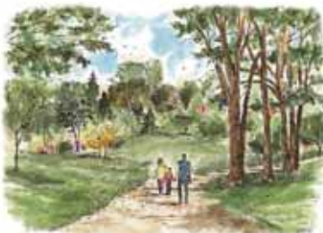
NA-1. Nichols Arboretum