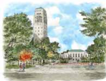
CC-8. Burton Tower/Rackham/Ingalls Mall