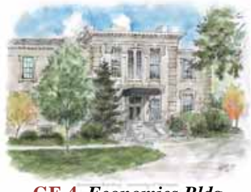
GF-4. Economics Bldg