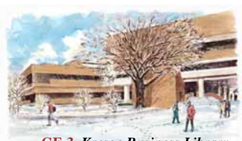
GF-3. Kresge Business Library