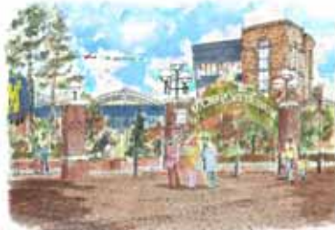
S-5. Stadium Gates #3