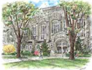
CC-22. Law Library