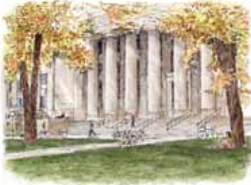
CC-4. Angell Hall #4