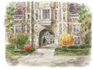
CC-24. Law Quad Arch #1