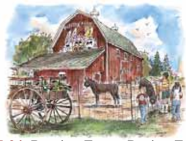
AT-24. Domino Farms Petting Farm