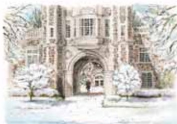
W-5. Law Quad Arch (winter)