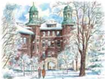
W-4. Engineering Arch (winter)