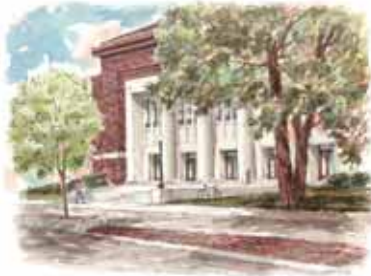
CC-16. Hill Auditorium #1