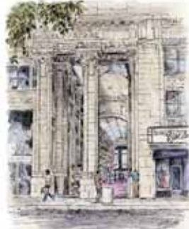
AT-2 Nickel's Arcade #2