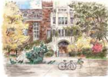
CC-35. Mich League with Fountain