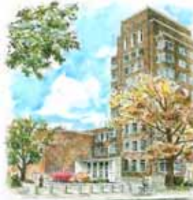
GF-2. Bus Admin Bldg