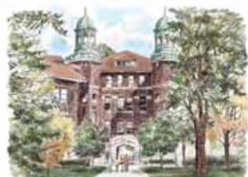
CC-14. Engineering Arch #2