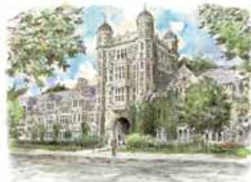
CC-28. Law Quadrangle