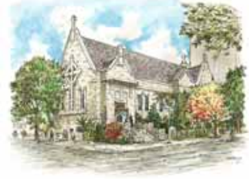
AT-21. St. Mary Student Chapel