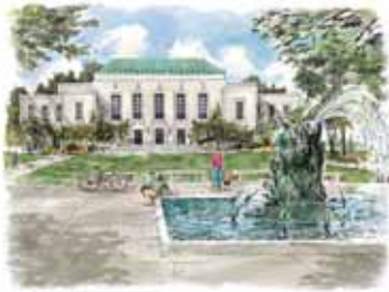
CC-19. Ingalls Mall/Fountain