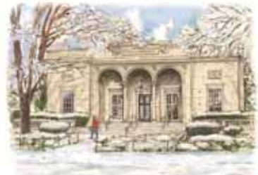
W-3. Clements Library (winter)