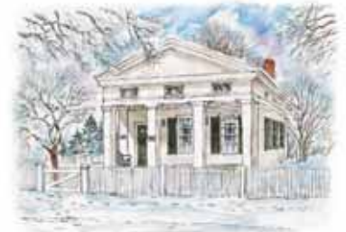
AT-18. Kempf House