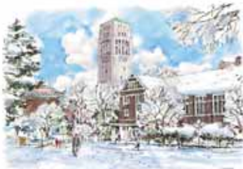
W-7. Michigan League (winter)