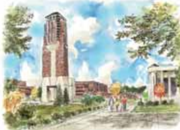
NC-2. Lurie Tower #2