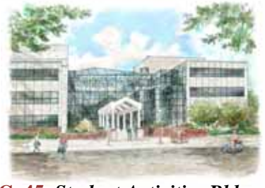
CC-45. Student Activities Bldg